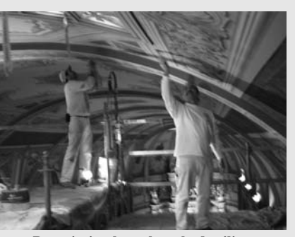
Re-painting barrel-vaulted ceiling

years now of a dedicated and highly skilled cadre of craftsmen whose involvement has gone far beyond just another job. The care they have lavished upon the Shrine is reflected in the internationally recognized quality of craftsmanship evident to all who experience