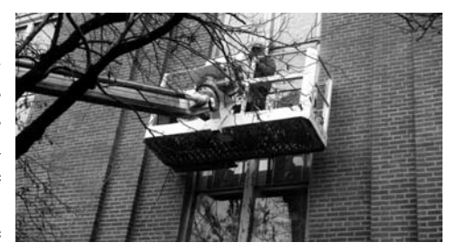
Workers from Rallo Co. applying over 1500 ft. of new trim boards around the 15 stained glass windows.

The rotted trim was replaced with over 1500 linear feet of pre-primed fir for the 15 windows. The project was done by Rallo Construction Co. with the painting and necessary caulking done by Picco and Benson Painting Co. at a total cost of nearly $35,000.