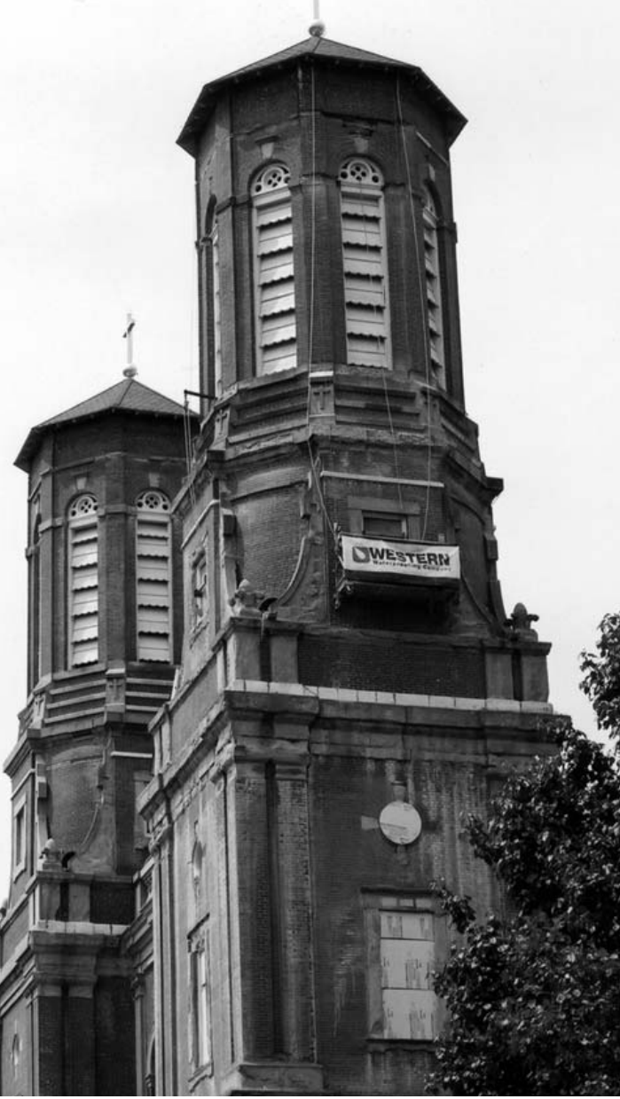
Workers on platform called staging suspended down from top of east tower with cables are in the process of cutting back and removing deteriorated sandstone.

1220 N. 11th Street + St. Louis, Missouri 63106-4614 + Rectory Telephone (314) 231-9407